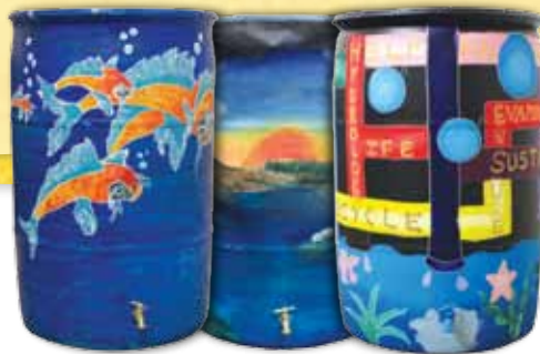
Rain barrels painted by high school students to promote water conservation