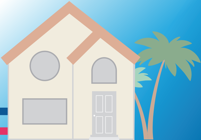
Diagram for illustrative purposes only. Homeowner responsibility may vary.